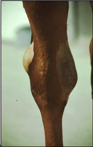
Distended hock joint (bog spavin) from OCD

Hormonal imbalances, involving insulin, thyroxin and growth hormone, may occur when growth rates are excessively encouraged, and these may result in improper subchondral bone development and cartilage maturation. There is evidence to suggest that there is a genetic or inheritable basis to OCD, or at least to its predisposition. Traumatic damage to the cartilage within joints may also occur particularly due to excessive exercise or conversely following prolonged stall rest, contributing to the development of OCD.