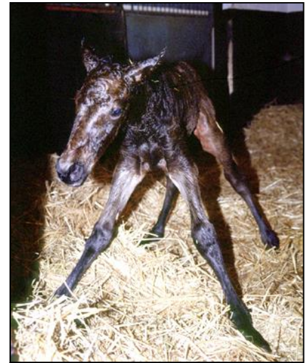
Newborn foal standing for the first time

6. Once standing with some confidence and stability, the foal will start curling its tongue and should start to make attempts to suck from just about anything that stands in its way. This might include the mare's elbows, nose, legs, the stable walls and you if you're in the way. This behavior just indicates that the foal is instinctively seeking out the udder. Most foals are sucking from the mare by 2 hours after birth and a veterinarian should be called if a foal has not had a good suck of milk by 4 hours of age.