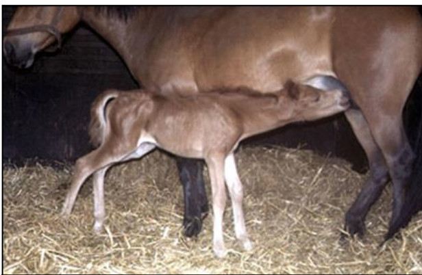
Foal suckling colostrum

Apart from udder seeking behavior, foals of this early age are not terribly inquisitive about their surroundings. Having discovered the udder, they tend to go back for frequent small feeds and are quickly able to stand up and lie down again for a rest or sleep. The mare's teats should appear permanently wet or shiny, showing that the foal has been sucking, and the foal should lay down and sleep after sucking, showing that it has been satisfied. The foal quickly establishes a rhythm of frequent feeding and sleeping. In a normal foal, any disturbance will quickly make it jump to its feet if it's lying down. Over the next 12 - 24 hours the foal will become increasingly interested in its surroundings and will have bonded closely with the mare so that it will call her if she is not in immediate sight and will follow her if she moves or is moved from one place to another. The foal should appear bright and alert and will develop periods of play by prancing and chasing around the mare between periods of feeding and sleeping. If all is well with mare and foal, there is no reason why, weather permitting, they should not be turned out together in a small paddock even at this very young age.