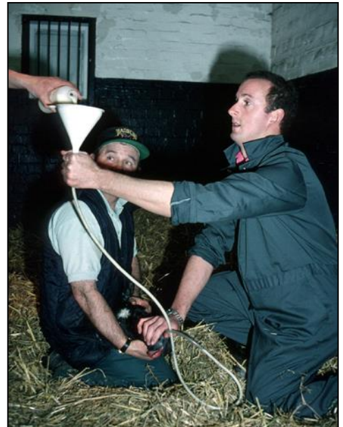
Colostrum administered by stomach tube

If at any time you are worried that your foal is not progressing normally, you should call your veterinarian without delay. A newborn foal can deteriorate very rapidly and the sooner help is obtained, the better the chances of your foal surviving and thriving. Do not adopt a ‘wait and see’ attitude as a little bit of experienced help might go a long way towards ensuring you have a healthy foal and mare at the end of the day.