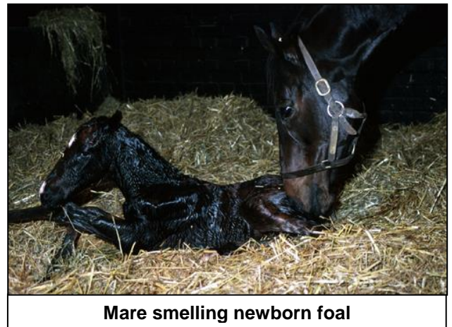
Mare smelling newborn foal