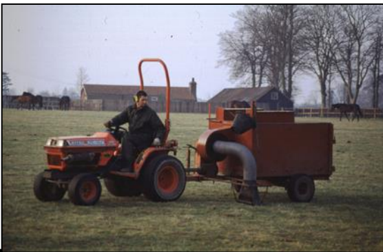
Mechanical removal of horse droppings from paddock

so grazing may need to be supplemented either with good quality hay or concentrates for performance horses or pregnant mares whose diet consists largely of grass. Vitamin and mineral requirements for unstressed adult horses can often be met entirely by grazing good quality pasture. It is rare for grazing horses to be deficient in a nutrient. Young growing horses, pregnant mares and performance horses may need supplementation in certain situations, but they should be used to address a certain problem, not “just to be on the safe side”. Many vitamin and mineral supplements are available commercially in the form of blocks which can be attached to a wall or placed in the feed tub to be consumed as desired. Other supplements come in liquid or powder form to be added to concentrated feed. Do not be tempted to mix supplements unless you have been advised to do so by your veterinarian or a competent equine nutritionist as it is possible to create imbalances.