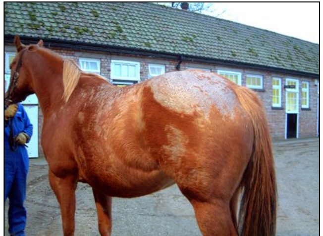
Horse with "rain scald" over back and rump

When the infection affects the lower limbs it is called mud fever and similar scabby lesions will be found, particularly on the back of the pastern and fetlock, and the limbs may become swollen. Rain rot may occasionally affect the face.