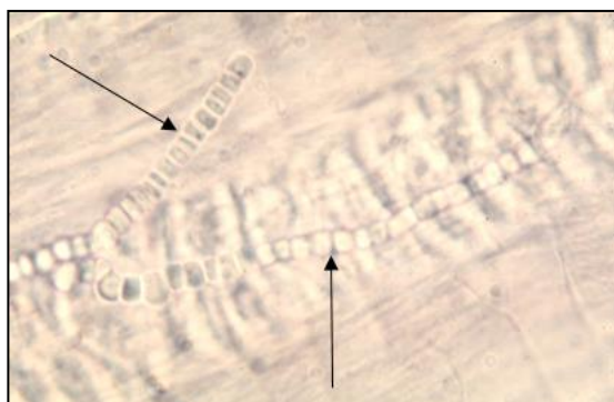
Ringworm spores in chains in a horse's hair under the microscope

Ringworm is transmitted from horse to horse by direct contact between horses, tack, grooming equipment, and clothing. The fungi are quite resistant to environmental factors and can remain on fence railings and timber structures for long periods. The most common method of spread is on tack such as bridles, boots, girths and grooming equipment. The fungi can remain on the skin for up to three weeks before clinical signs develop so the disease can be spread before there are signs of infection. Very often it is a new horse that introduces the condition to a barn. Younger animals are more likely to be affected than older ones, although very old or debilitated animals are also susceptible. Infection produces immunity which is quite long-lasting.