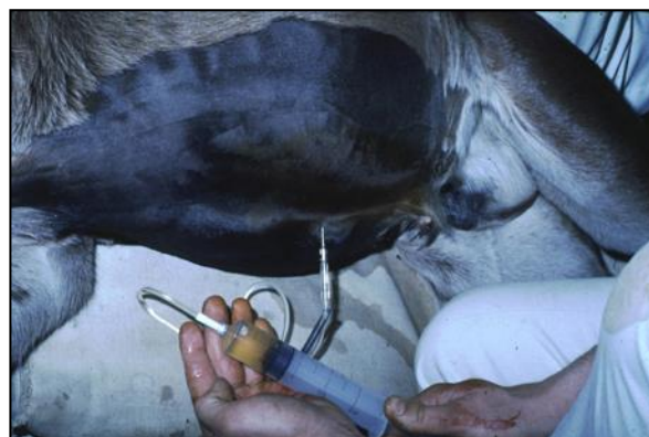
Urine being drained from a foal's abdomen

When bladder rupture occurs at birth, signs usually develop within 2 or 4 days of life. Colts are affected more often than fillies. If leakage of urine follows infection of the urachus, signs can develop later, but within a month of birth. Symptoms are caused by the accumulation of urine in the abdominal cavity rather than it being voided normally. This results in pressure on the diaphragm and toxemia as the waste products in the urine are reabsorbed into the foal's blood. Affected foals usually pass smaller-than-normal volumes of urine and adopt a fairly characteristic straining posture with the legs stretched out and the back flat. The abdomen becomes progressively more distended. The foal usually appears depressed and goes off nursing. Respiratory rate becomes more rapid and breathing can become quite labored particularly when the foal lies down as pressure builds up against the diaphragm. The heartbeat can become weak and rapid and cardiac arrhythmias can develop due to abnormalities in electrolyte levels in the blood. If left untreated, collapse and death usually follow.