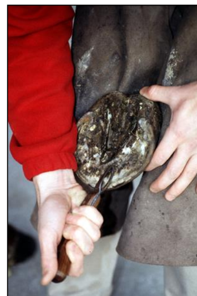
Searching a foot for signs of abnormality

The affected foot should be re-shod regularly to gradually encourage heel expansion.